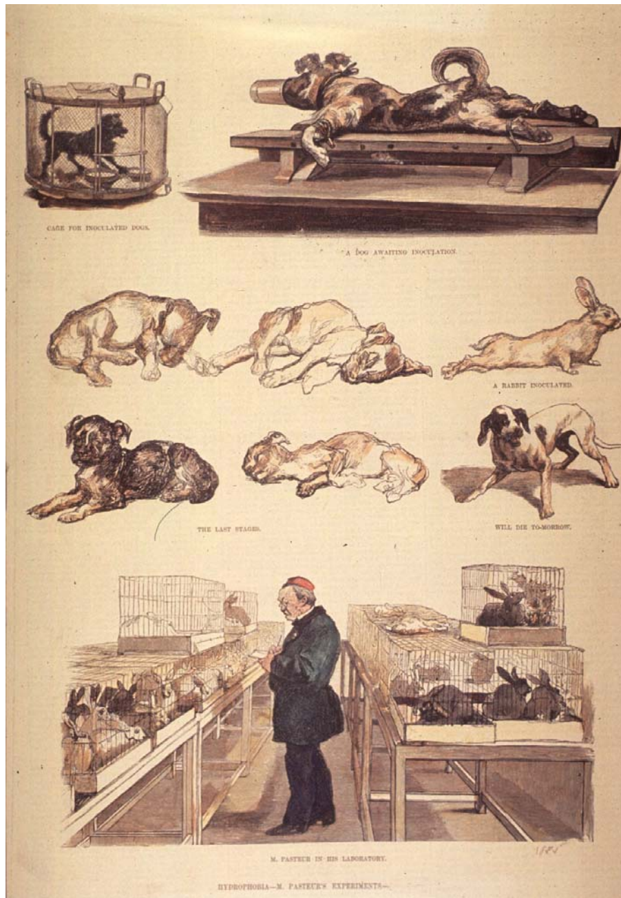
Figure 4. This full-page illustration of Pasteur in his animal facility was published in Harper's Weekly in the United States, on 21 June 1884. At this time, there was moderate curiosity on Pasteur's work in the US, which would intensify after his first successful human trials of a therapeutic vaccine for rabies in 1885. In the article, the reader is reassured that the use of dogs is both humane and justified in the interest of mankind. The use of other species, however, is barely mentioned [5].

Robert Koch, a practicing rural physician, would follow the tradition of the great German/Prussian physiologists of his time (and indeed was a student to many of them), providing invaluable contributions to medical knowledge through animal research, mainly in the field of bacteriology and pathology. His famous “Koch postulates” would play an important role in microbiology. Along with his associates,