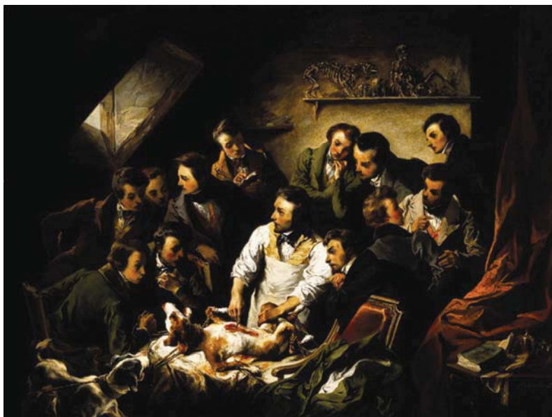
Figure 3. “A physiological demonstration with vivisection of a dog,” by Émile-Édouard Mouchy. This 1832 oil painting—the only secular painting known of the artist—illustrates how French scholars valued physiological experimentation in service of scientific progress [90]. Notice how the struggling of the animal does not seem to affect the physiologist or his observers. Currently part of the Wellcome Gallery collection, London.