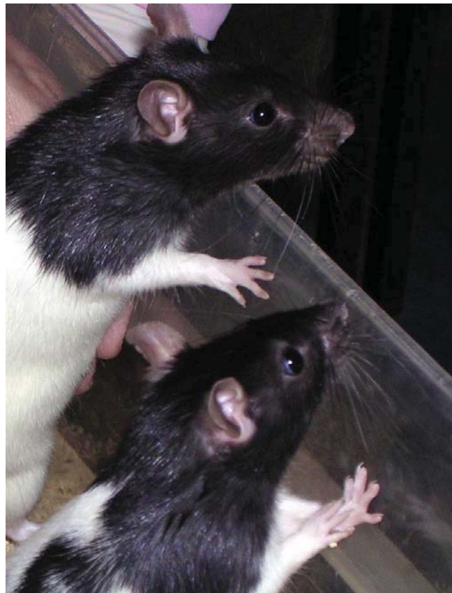
Figure 5. Two outbred laboratory rats, of the Lister Hooded (Long–Evans) strain. Rodents are the most commonly used laboratory animals, making up nearly 80% of the total of animals used in the European Union, followed by cold-blooded animals (fish, amphibian and reptiles, making up a total of 9.6%) and birds (6.3%) [159]

2007 Nobel Prize. In 2002, the mouse became the second mammal, after humans, to have its whole genome sequenced. These, along with other technologies, have opened unlimited possibilities for the understanding of gene function and their influence in several genetic and non-genetic diseases, and have made the mouse the most commonly used animal model in our day (for a historical overview of the use of the mouse model in research, see [157,158]), with prospects being that it will continue to have a central role in biomedicine in the foreseeable future.