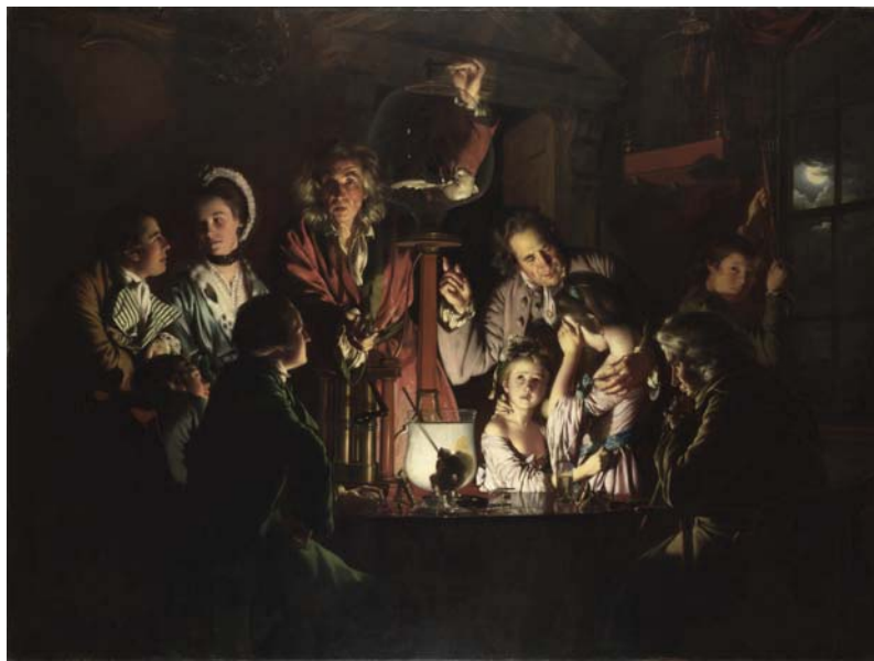
Figure 2. “An Experiment on a Bird in an air pump”, by Joseph Wright of Derby (detail) (1768). In this brilliant artwork, the artist captures the multiple reactions elicited by the use of live animals as experimental subjects in eighteenth-century Britain, for which we can find a parallel in present day’s diverse attitudes on this topic, including shock, sadness, appreciation, curiosity and indifference. Currently in The National Gallery , London.

The moral acceptability of inducing suffering in animals on the physiologist’s workbench would also become an issue raised in opposition of vivisection before the end of the seventeenth century [3]. However, the acceptance of the animal-machine paradigm by many physiologists reassured them that their scientific undertakings were not cruel. Furthermore, even the many who acknowledged that animals suffered a great deal with experiments, nevertheless defended themselves against the accusation of cruelty by alleging that the suffering inflicted was not unjustified, but rather for the sake of humankind, in the same line of reasoning by which today animal research is still justified.